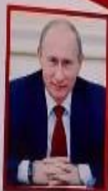
Президент РФ Путин Владимир Владимирович